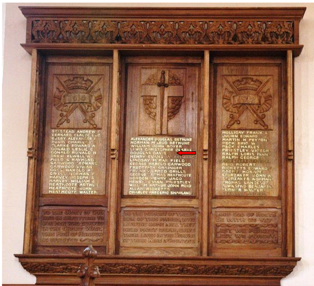
St. Andrew's Church Roll of Honour