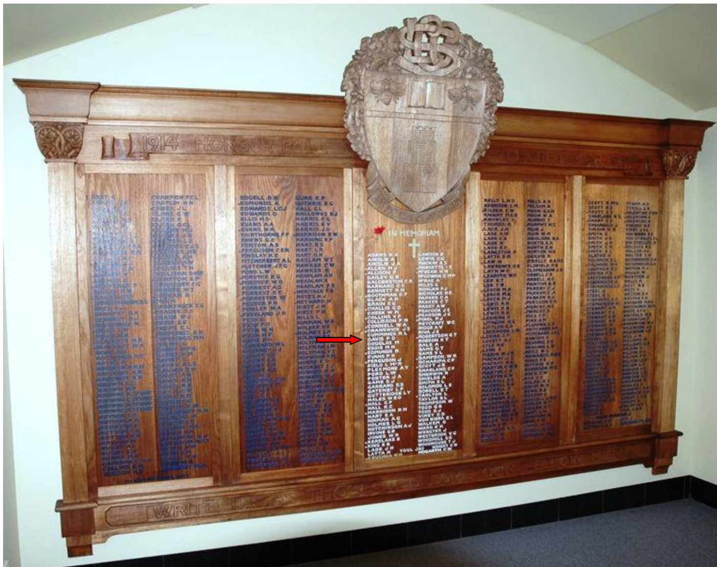
Launceston Church Grammar School Roll of Honour