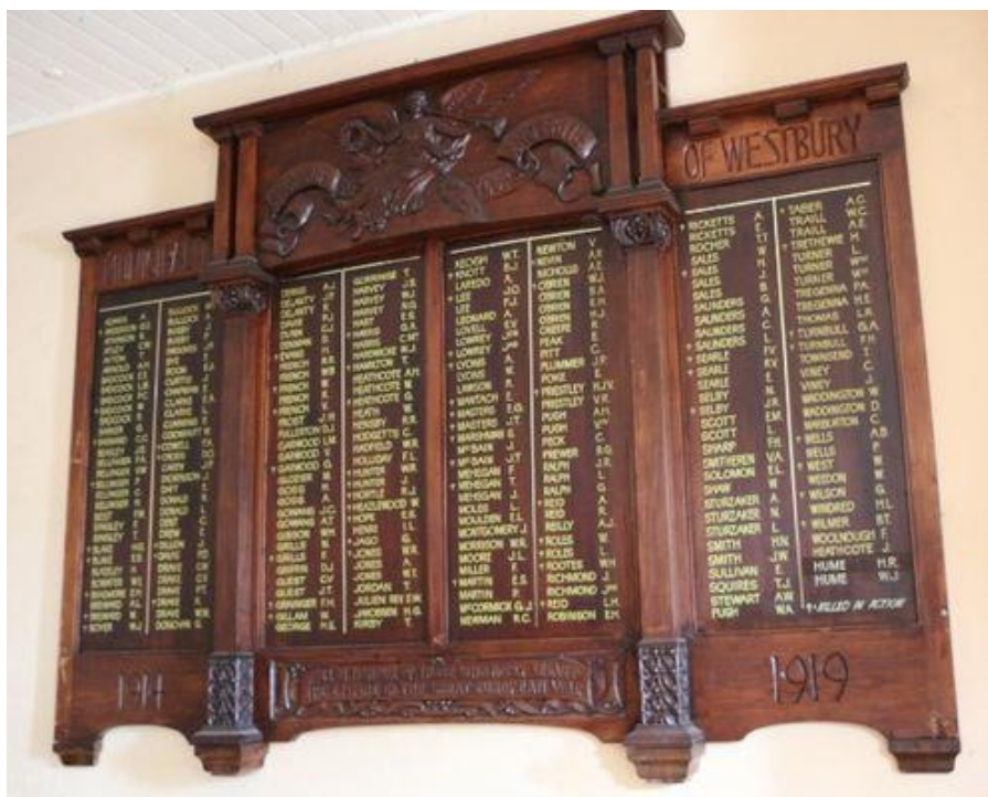
Westbury Roll of Honour